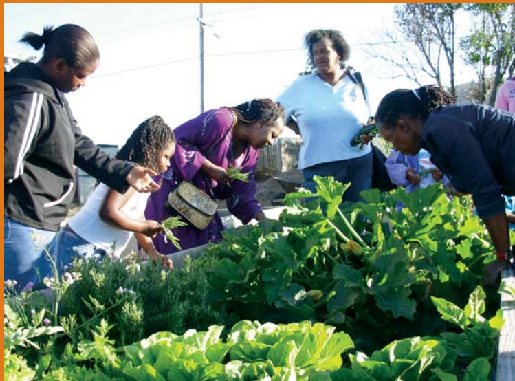
Harvest time at the community garden in Candlestick Park.

engage and focus their work. By making a five-year commitment, Koshland understands that it takes more than simply walking into a neighborhood and granting money. Communities like Bayview have suffered the degenerative symptoms of neglect for many years. Yet there are amazing stories to be told of strong-willed and unsung heroes supporting their community and working to provide a better future for the next generation.