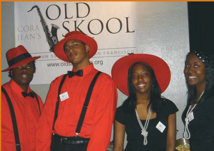
Youth from Old Skool Café enjoy hosting an evening of food, entertainment, and history.