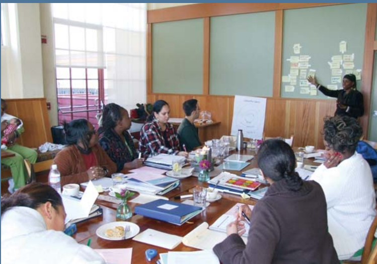
The Bayview Fellows during a leadership development training session.

They are now tightening up their vision for the Bayview and are in the midst of planning a project that will create enrichment opportunities to unite the diverse groups and generations of Bayview in a building project that will beautify the landscape of the community. They aim to accomplish this by partnering with a community park as a “gathering place” where they could host cultural events, outdoor recreation activities, and provide educational classes. Additionally, they will highlight the rich history and culture of the Bayview.