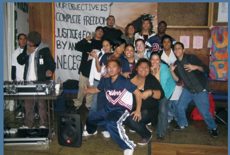
Richmond High School students from mini-grantee Youth Together celebrating Unity Week.