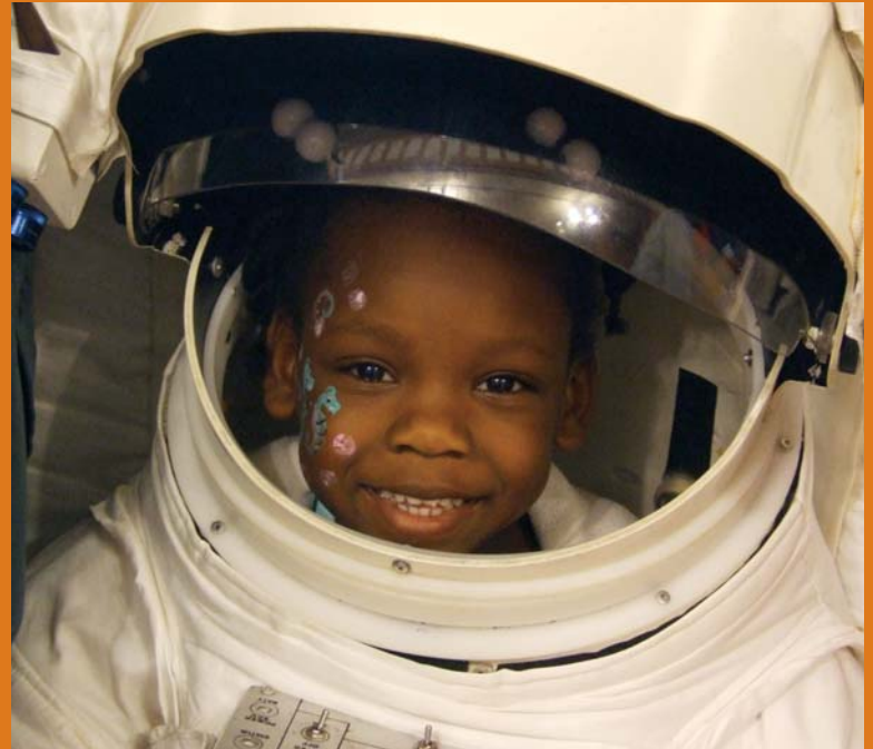
A youngster enjoys the Reach Out for the Rainbow Science Fair in Bayview.

While seen as a traditionally African American community, the Bayview neighborhood is undergoing demographic transformations. Asian/Pacific Islander and Latino populations are growing and influencing the neighborhood. As these demographics evolve it will be necessary to weave these new groups into the fabric of the community.